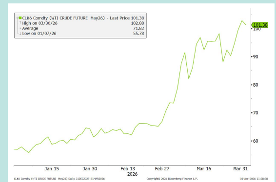
WTI Crude Oil (YTD)