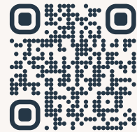
CPB's Business Express online application portal